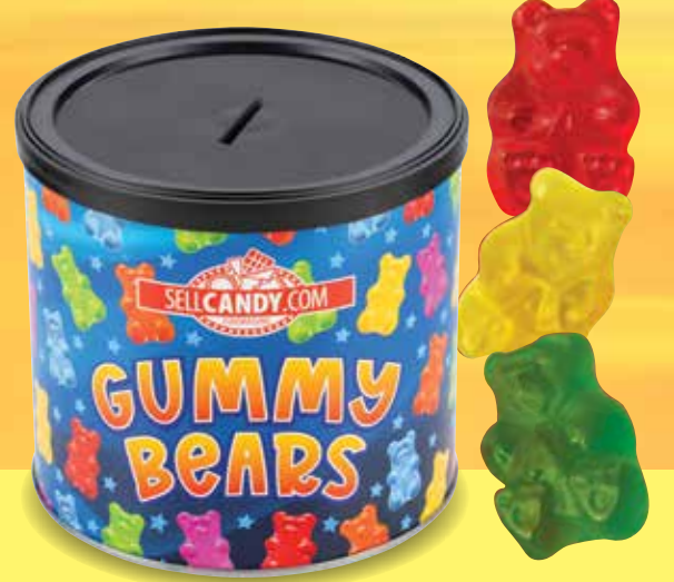
1001 • Gummy Bears • $14 Fruit flavored gummy bears are an all-time favorite. 6 oz.