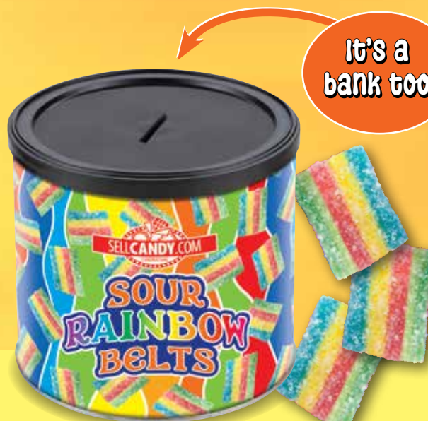
1009 • Sour Rainbow Belts • $14 Bursting with sour fruit flavor and a tangy sweetness. 5 oz.