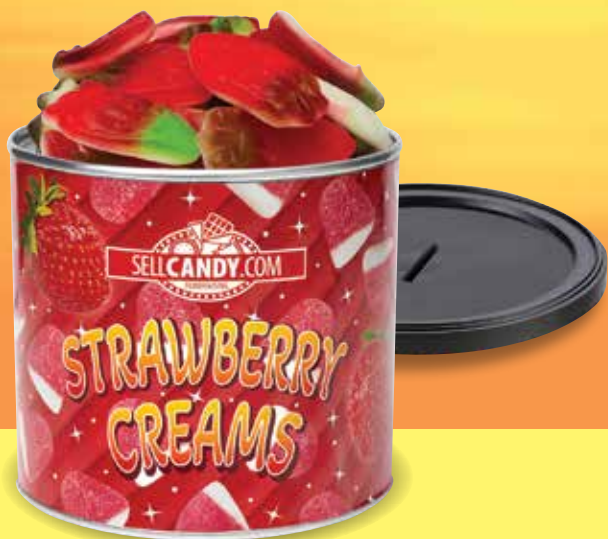
1006 • Strawberry Creams • $14 Strawberry gummy atop a pillow of marshmallow. 6 oz.