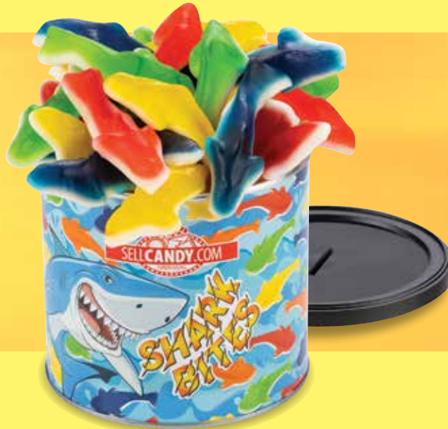
1004 • Shark Bites • $14 Colorful two-layered gummy sharks with white bellies. 6 oz.