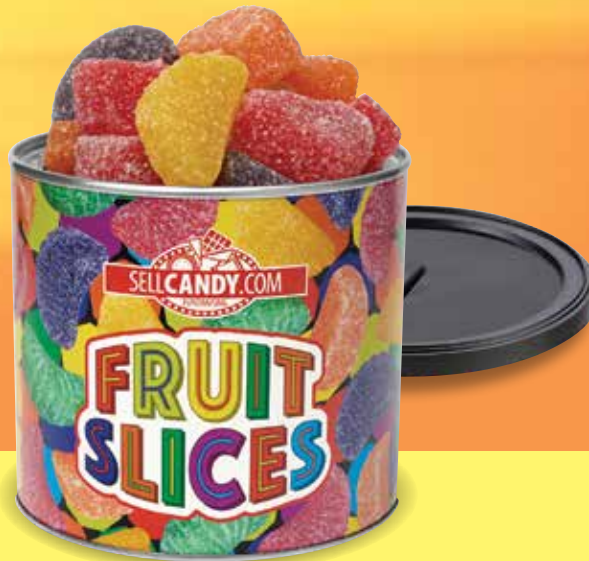
1008 • Fruit Slices • $14 Fruit flavored chewy wedges in delicious fruit flavors. 6 oz.