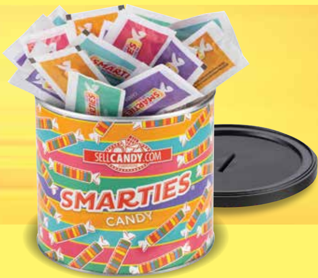
1003 • Smarties® Candy • $14 Classic Smarties® candy in tasty colors and flavors. 6 oz.