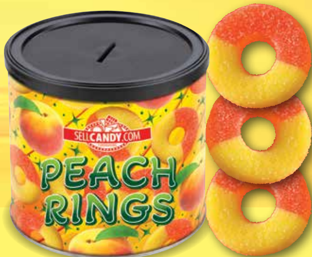
1005 • Peach Rings • $14 Gummy chewy goodness with a sweet peach flavor. 6 oz.