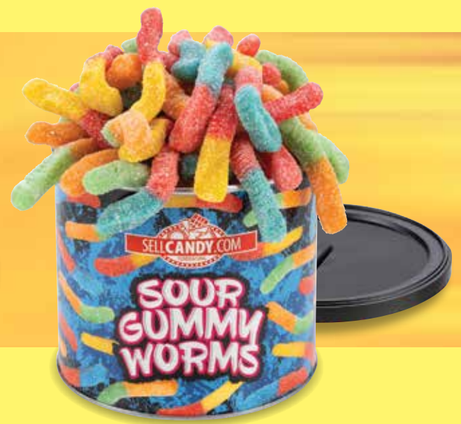
1002 • Sour Gummy Worms • $14 Soft and chewy gummy worms that start off sour then turn sweet. 6 oz.