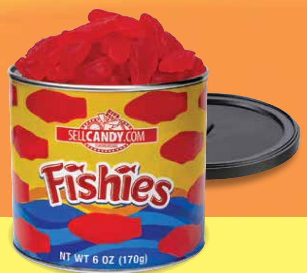
1007 • Fishies • $14 Chewy and fruity red fish shaped gummy candy. 5 oz.